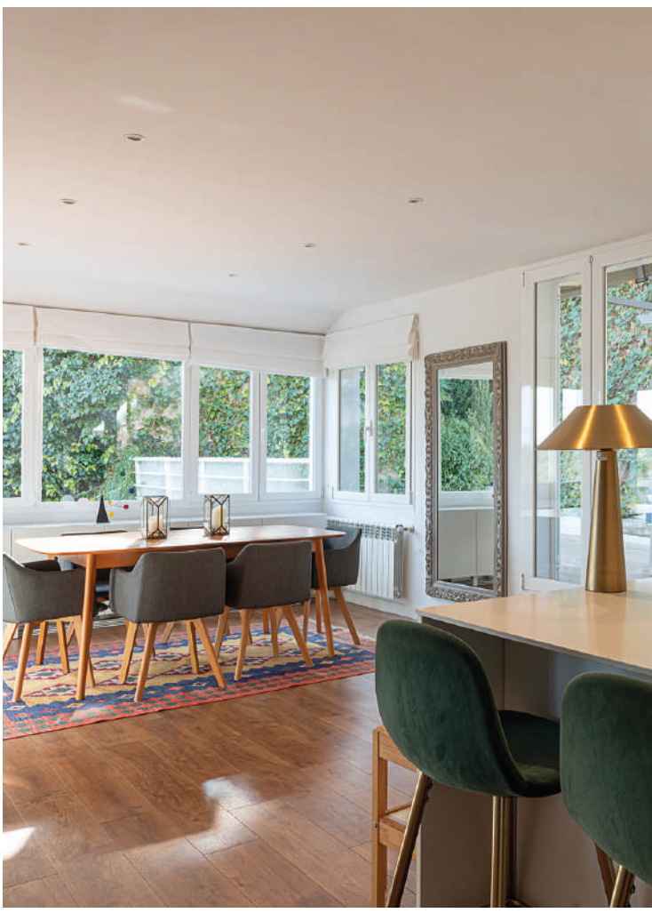
LUXURY RENOVATED APARTMENT