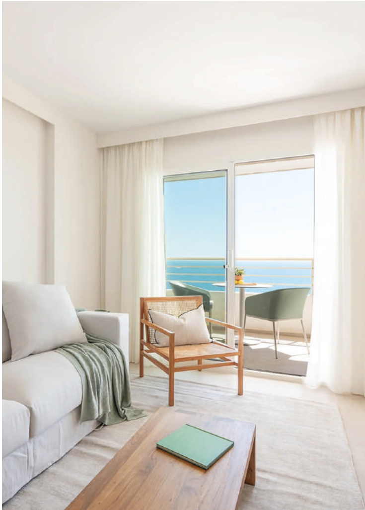
RENOVATED SEA FRONT APARTMENT