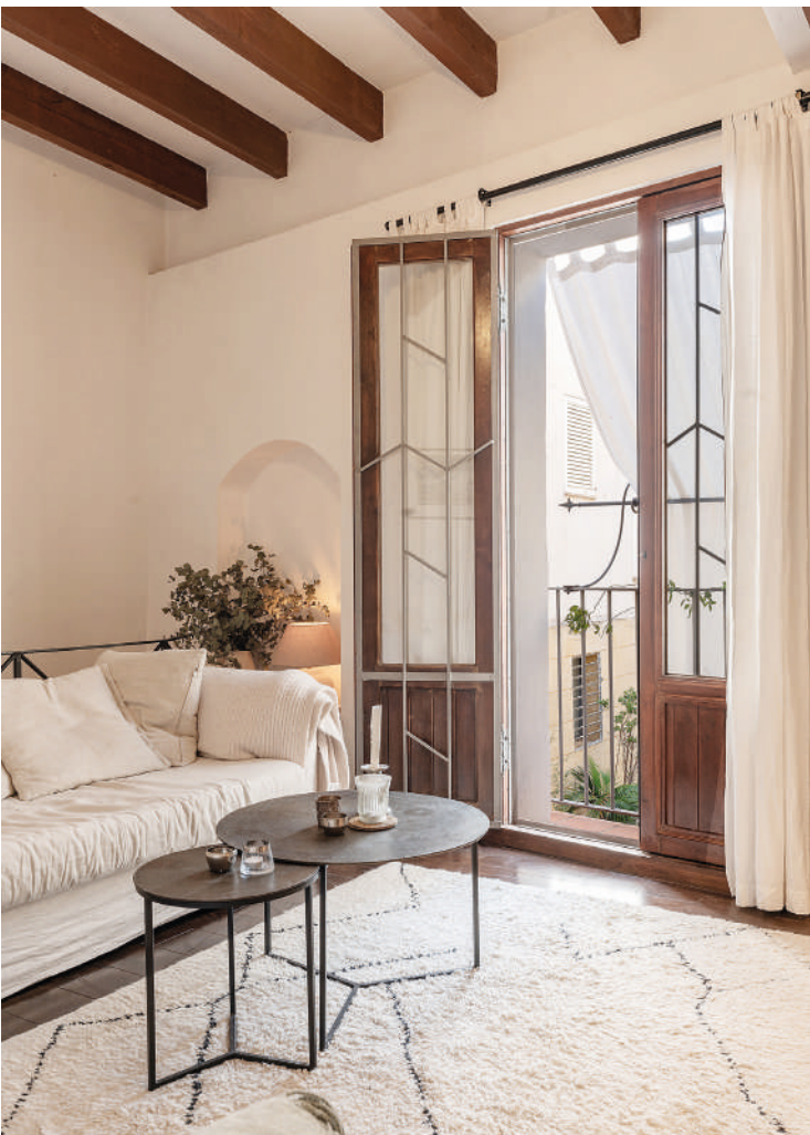
THE PERFECT LITTLE TOWNHOUSE