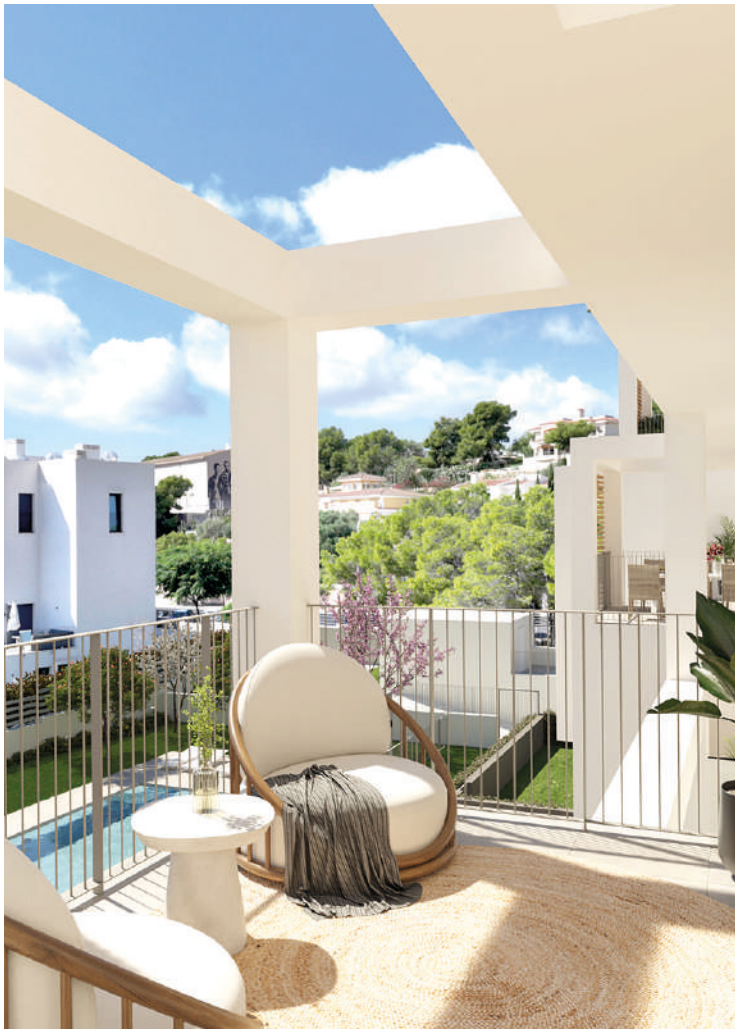
NEW RESIDENTIAL PROJECT