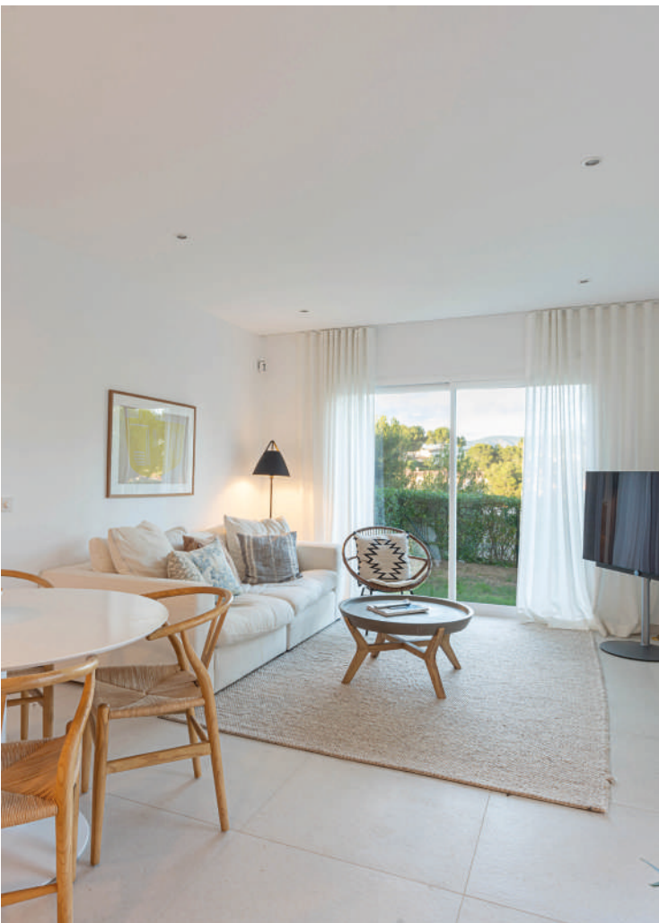
LOVELY GROUND FLOOR APARTMENT