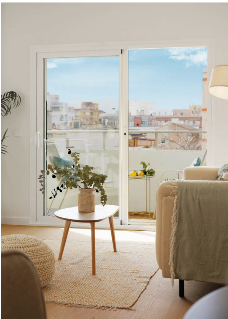
STYLISH NEWLY RENOVATED APARTMENT