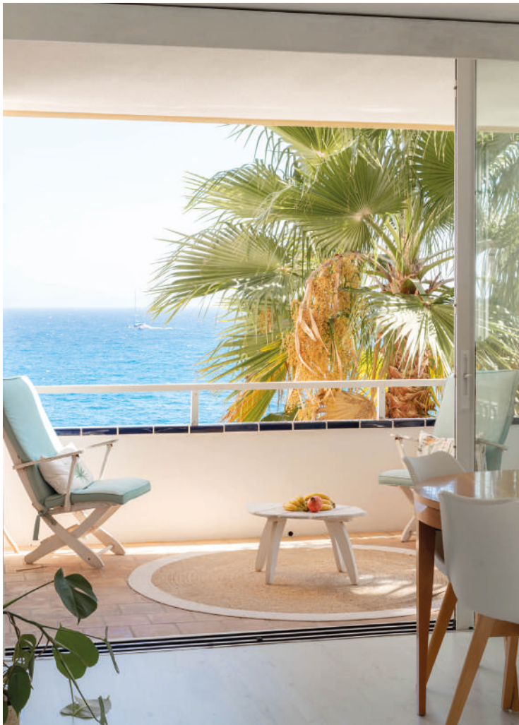
NICE APARTMENT WITH BALCONY