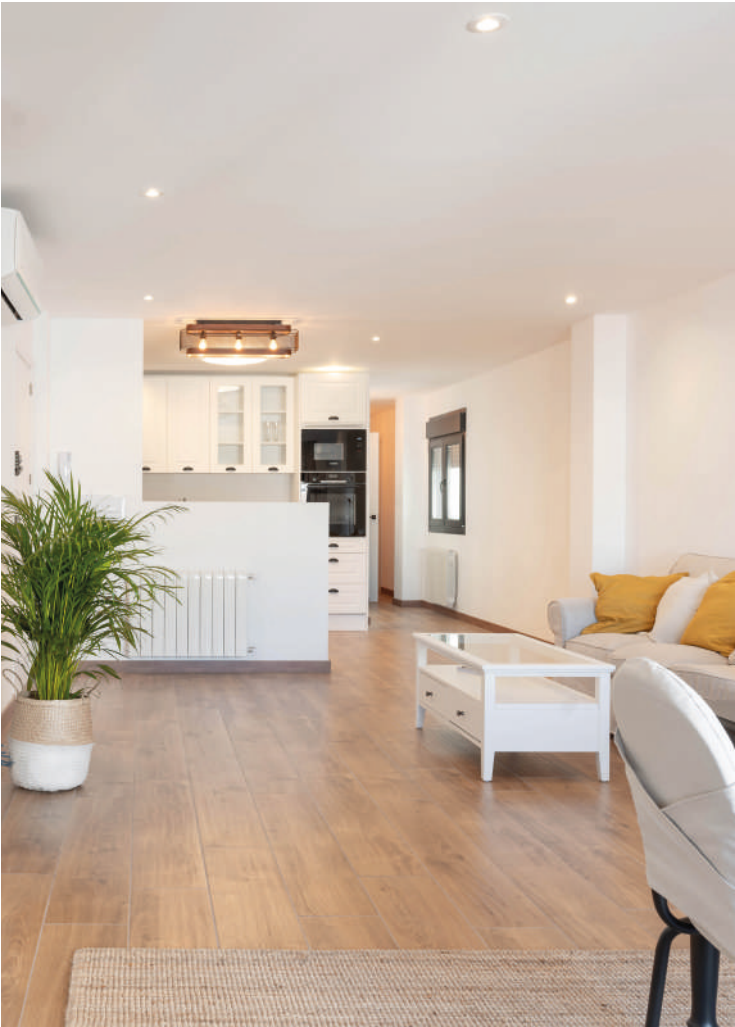
BRIGHT NEWLY RENOVATED APARTMENT