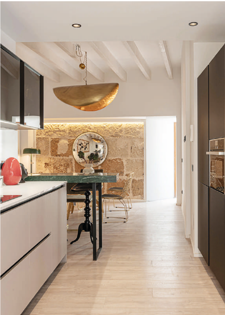
TRENDY TOWNHOUSE WITH TERRACE