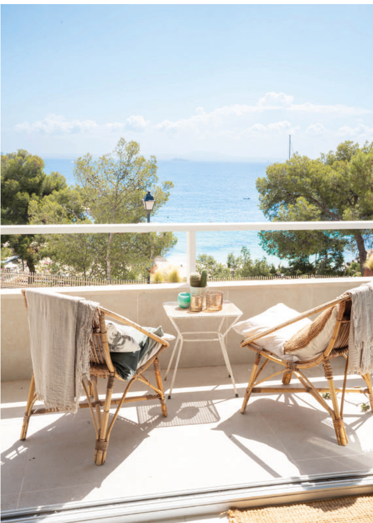
NEWLY RENOVATED APARTMENT