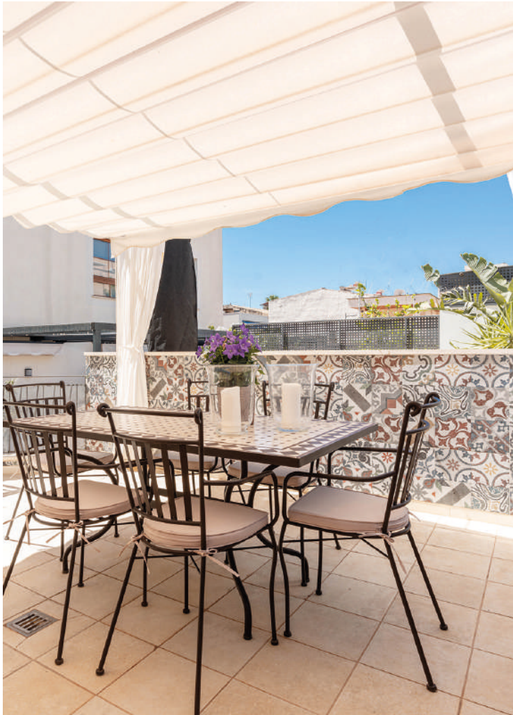
MODERN NICE APARTMENT