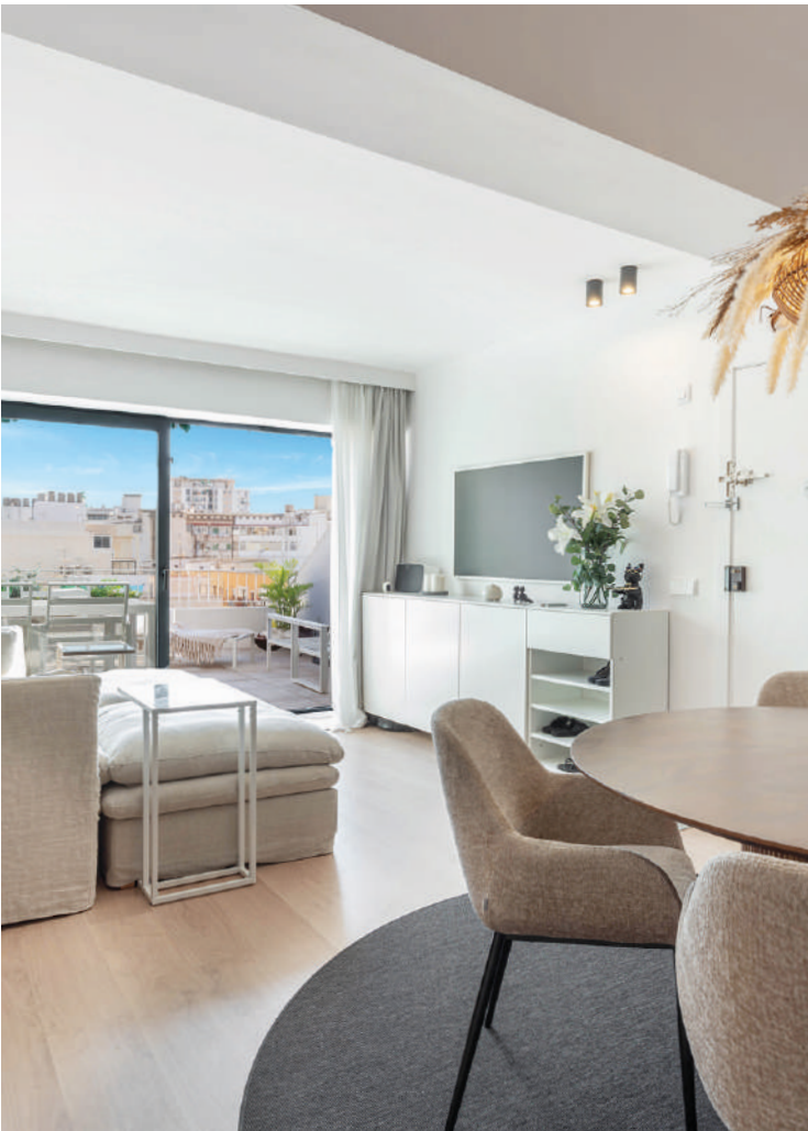
LOVELY PENTHOUSE WITH TERRACE