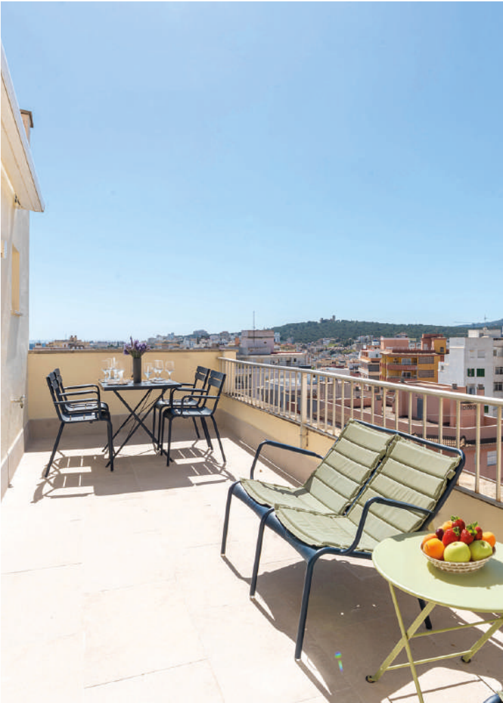
BRIGHT AND MODERN APARTMENT