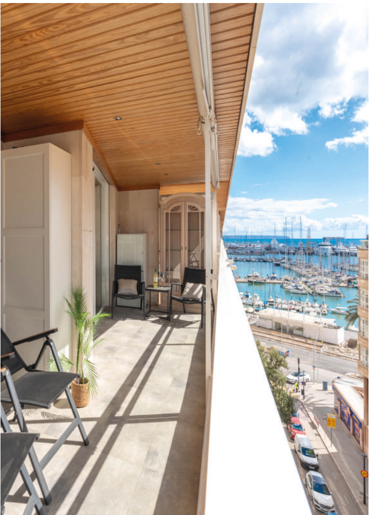
APARTMENT WITH COMMUNAL POOL