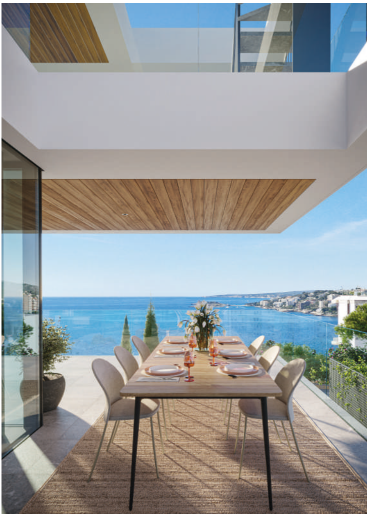
NEW LUXURY PROJECT WITH SEA VIEWS